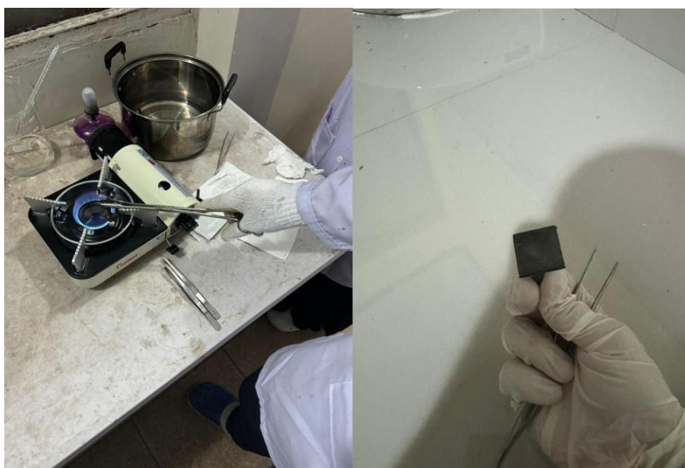
Figure 2. Preparation for the induction of burns using a metal plate