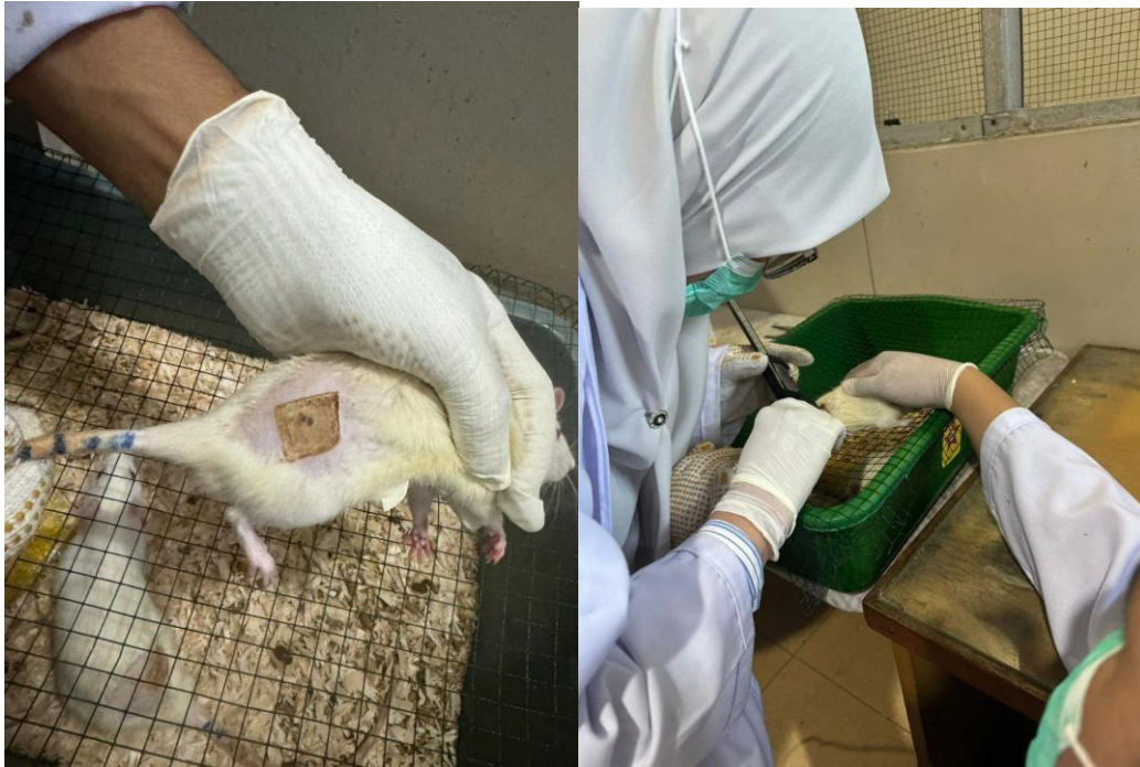
Figure 3. Measuring the area of burns before administering honey and silver sulfadiazine intervention