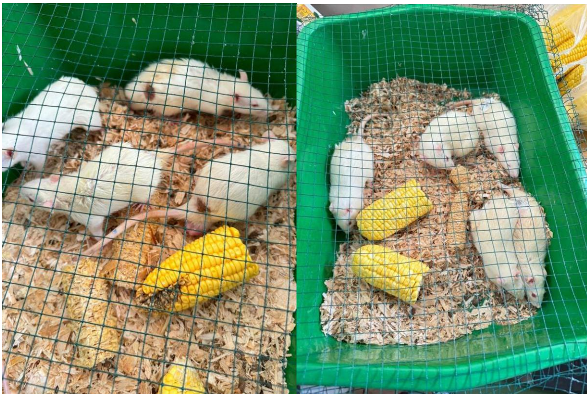
Figure 4. The process of treating burns using honey and also silver sulfadiazine ointment