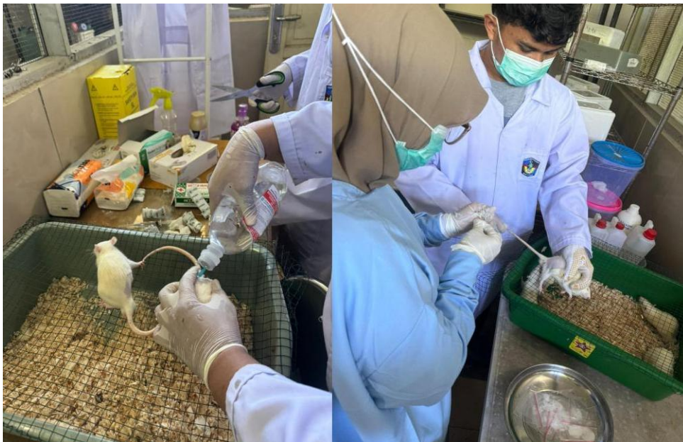
Figure 1. The process of shaving, cleaning and administering topical anesthesia (lidocaine prilocaine 5%)

The difference in group averages can be seen in the Multiple Comparisons table (by looking at the * sign), the improvement in the area of burns in the Treatment group 1 is significantly different from negative controls group, the improvement in the area of burns in the Treatment group 2 is significantly different from negative controls group, the improvement in the area of burns Positive controls group is significantly different from negative controls group and negative controls group is significantly different from all groups. Statistically, the mean difference between groups 1 and 2 was not significantly different ( p=0.514 ). This means that administering 1 g and 2 g had the same effect.