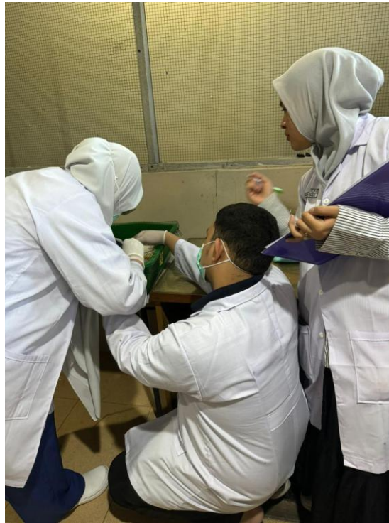
Figure 5. Measurement of burns after administering honey intervention and silver sulfadiazine ointment