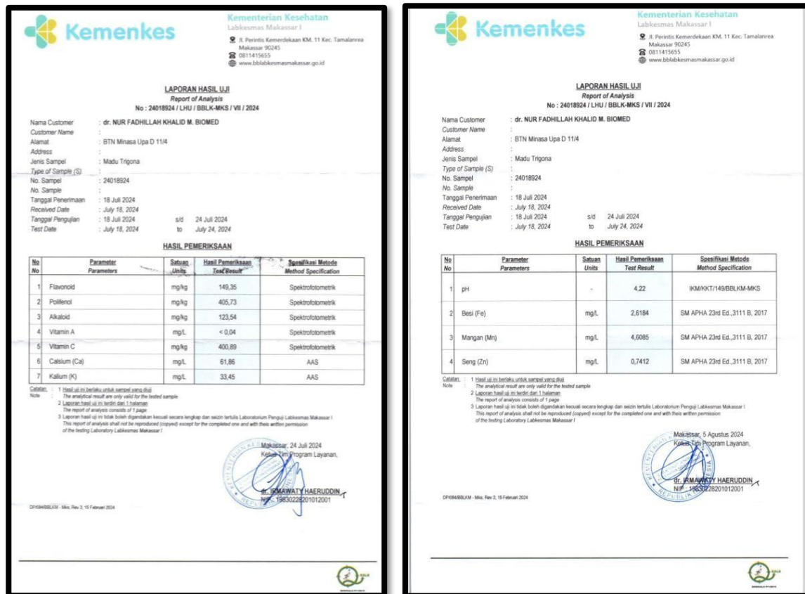
Figure 6. Examination nutritional contents of Trigona honey Spp.